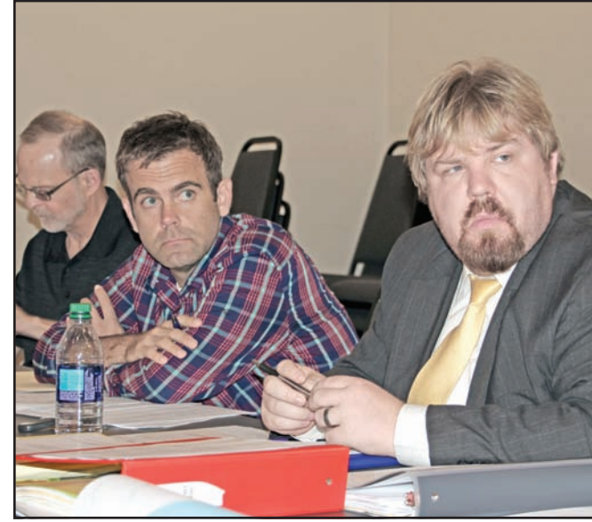
The Young Harris City Council met for several hours on Tuesday, Oct. 4, to discuss matters important to the city. Regular meetings are always the first Tuesday of the month, starting at 7 p.m.

month after month toward the eventual development of the project.